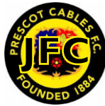
PRESCOT CABLES JUNIOR FOOTBALL CLUB